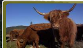
Hairy Coo Safari